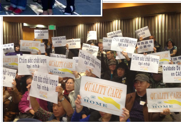
Santa Clara County In-Home Supportive Services Workers at Board of Supervisors Meeting