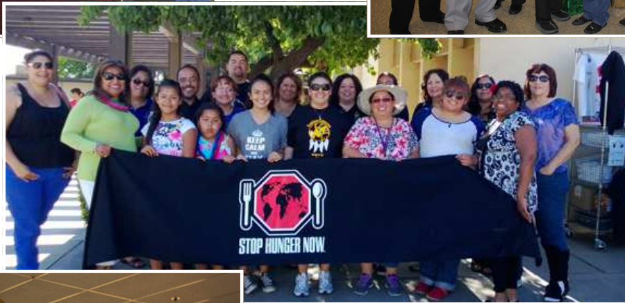
Latino Caucus and Women's Caucus in Fresno joined community organizations, packaging 10,000 dehydrated meals to use in crisis situations around the world.