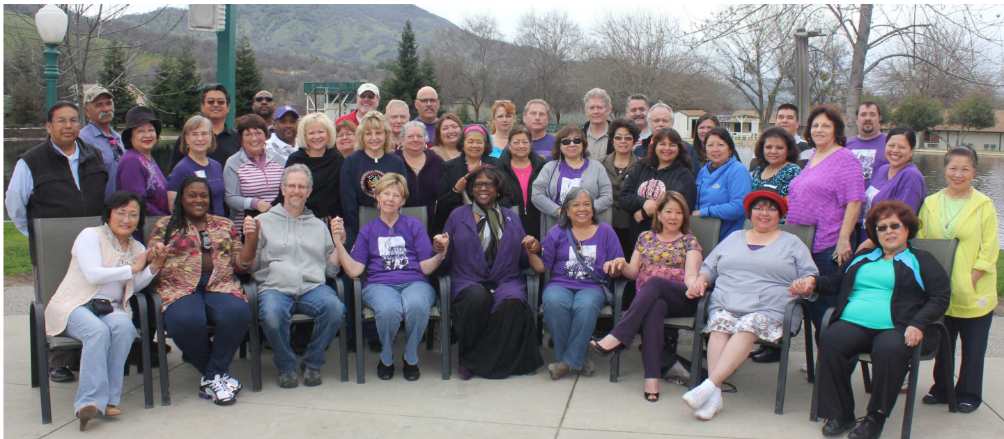
2013 Executive Board Retreat in Wonder Valley