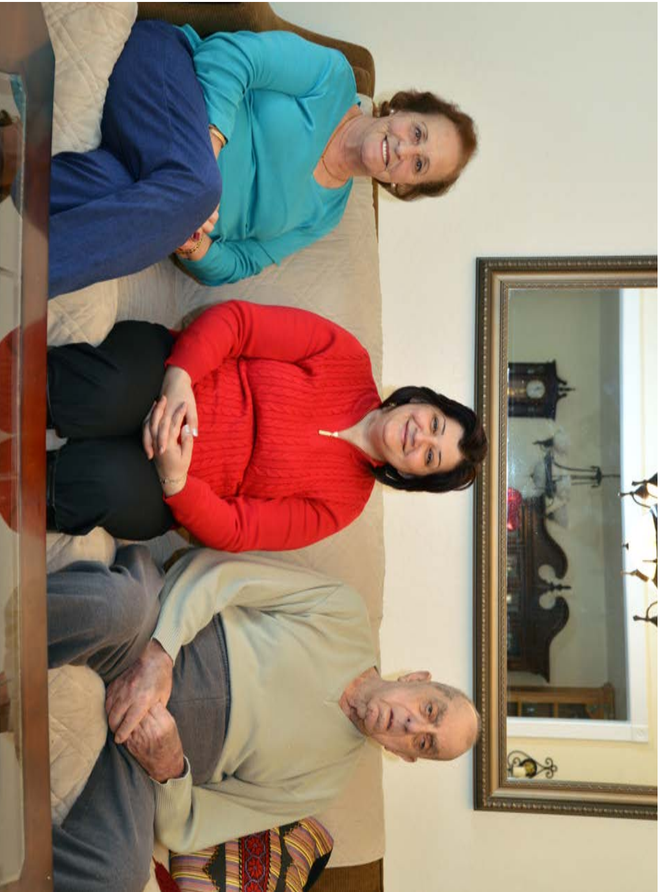
Hanging-out w/ Salem and Violet